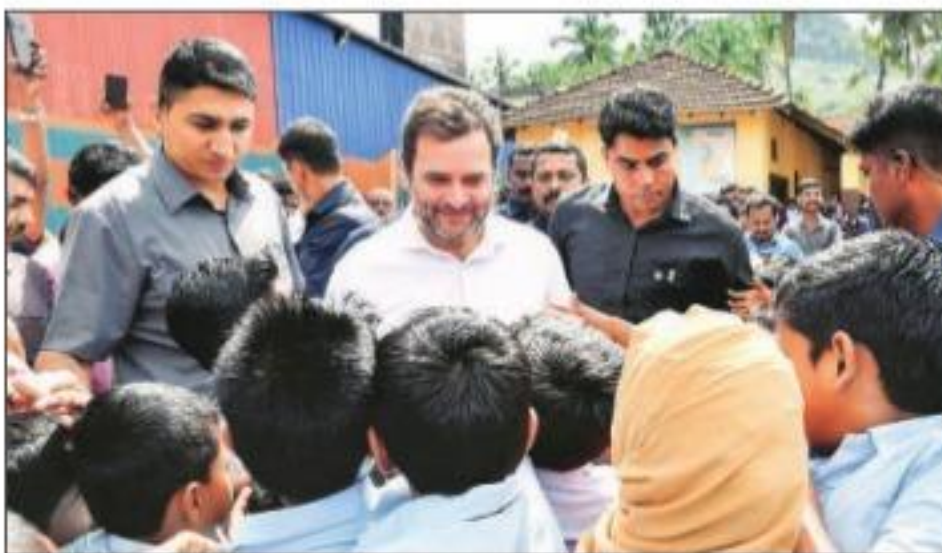
Congress leader Rahul Gandhi visits flood-affected areas in his Lok Sabha constituency of Wayanad.

A FORTNIGHT after she returned as Congress president, Sonia Gandhi has begun an exercise to revamp the AICC secretariat and some state units. Many in the party, however, argued that a mere tweak here and there would be meaningless, and that the party should be focusing on getting its messaging right, especially on issues of ideology and nationalism, to effectively counter the BJP.