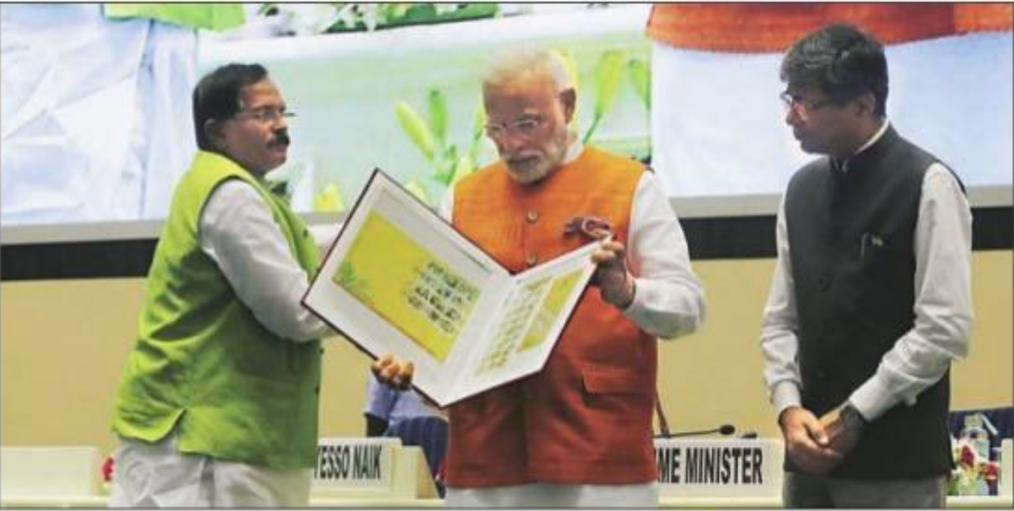
Prime Minister Narendra Modi and Union Minister of State for AYUSH Shripad Yesso Naik during a function for the promotion and development of Yoga. Anil Sharma

The October 2 campaign will in turn kick off a larger campaign till Diwali (October 27) on the segregation, transportation and recycling/disposal of waste. The matter will be highlighted at the UN conference on September 24. The government will provide special remission to jail inmates from October 2 to January 30, 2020, Gandhi busts will be unveiled in 54 countries, all iconic buildings across the country will be lit up on Gandhi Jayanti, light and sound shows will be held at India Gate in Delhi, Rajkot and Guwahati, 1,50,000 cyclists will cycle across India as a part of the celebrations, and a Gandhithemed national handicrafts fair will be held from October 1 to 15. In addition, 1 lakh students will be roped in to assemble solar lamps.