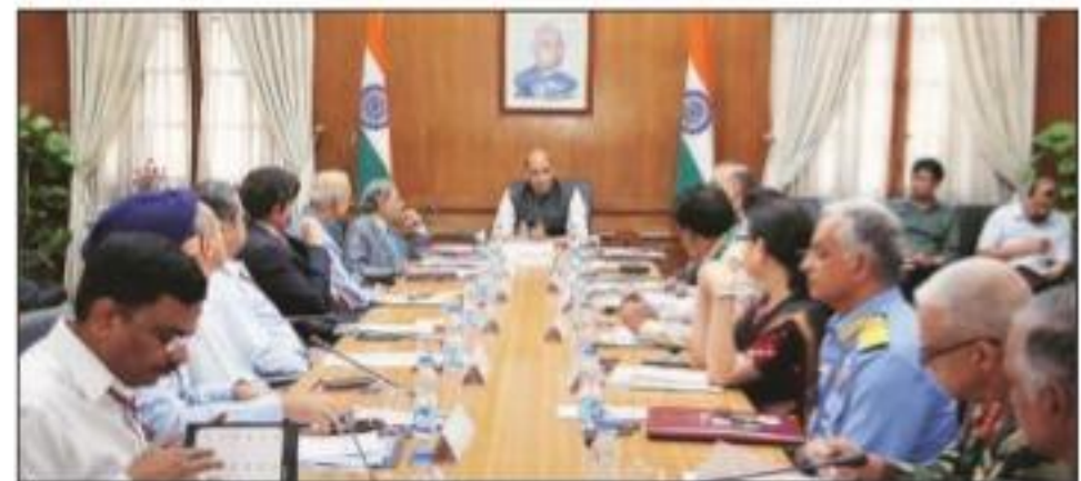
Defence Minister Rajnath Singh during a meeting with the chairman of the 15th Finance Commission, N K Singh.

Defence Minister Rajnath Singh was present at the meeting. Multiple sources told The Indian Express that ministry officials informed the Commission about the chronic shortfall of funds. Ministry officials are also